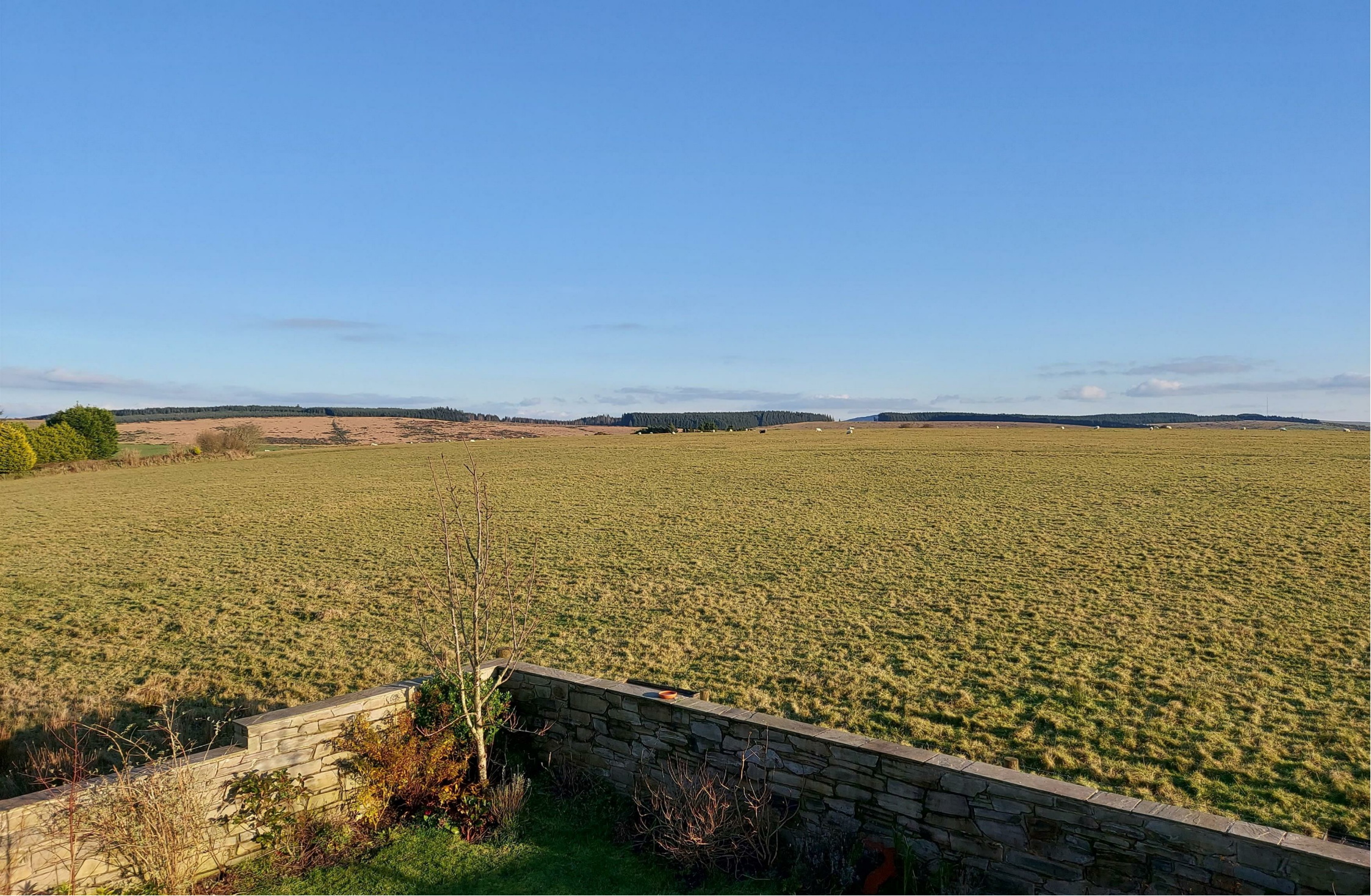
Todda Close, Bolventor, Launceston, PL15 7FP